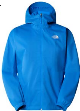
1. The North Face Sangro Jacket • 2. Columbia Pouring Adventure Jacket • 3. Rab Downpour Eco Jacket 4. Rab Microlight Jacket • 5. Helly Hansen Paramount Jacket • 6. The North Face Quest Jacket